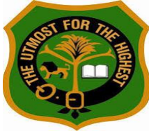
Calabar High School

FIRST Global Challenge | August 13 – 18, 2018 | Arena Ciudad de Mexico | Mexico City